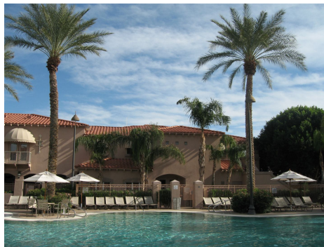
Scottsdale, Arizona – Dec. 19, 2008