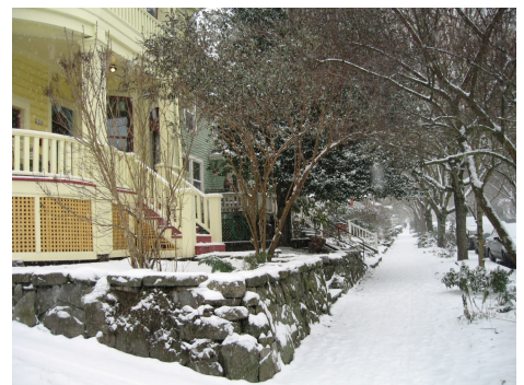
Portland, Oregon – Dec. 20, 2008